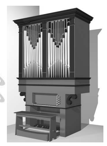
Rendering of seven stop tracker organ for Wesley United Methodist Church - Elkton, MD

It is a rare company that can encompass the best of it all, yet this is our goal.